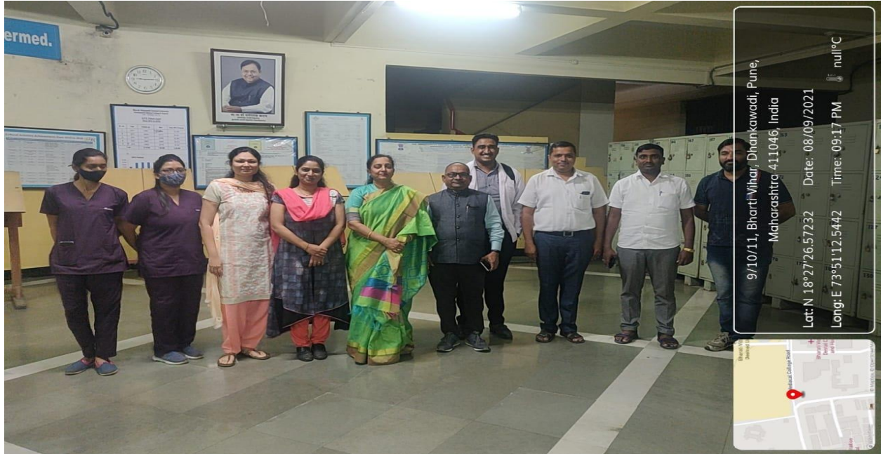
(BHARATI VIDYAPEETH POST COVID WEBINAR COMMITTEE MEMBERS)