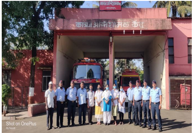
BVDUHMC team with staff of PMC, Fire Brigade, Katraj, Pune