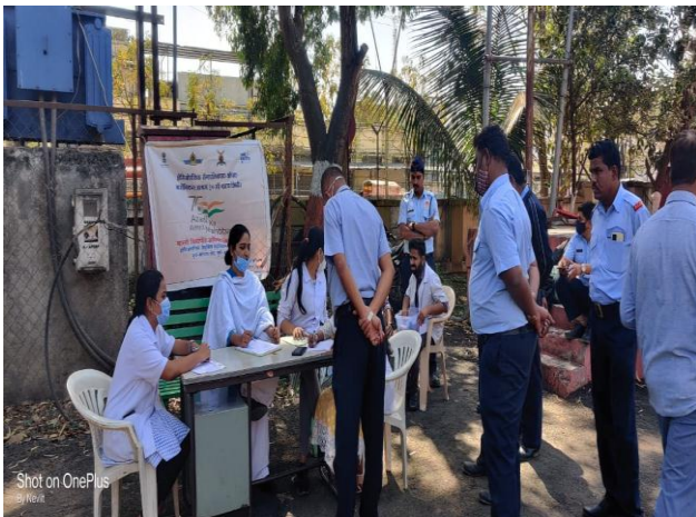
Distribution of Arsenic Album 30 C