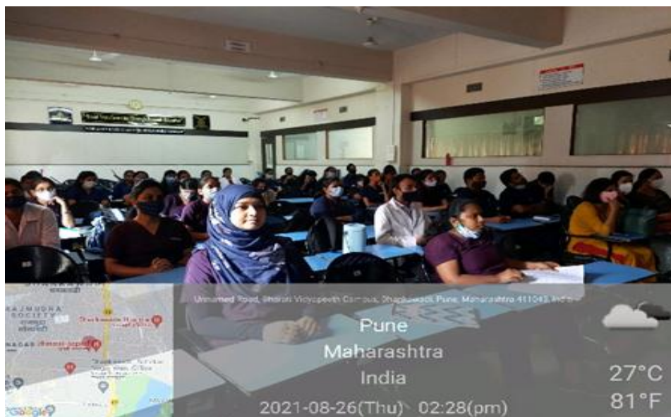
P. G. Scholars and Interns at the Lecture