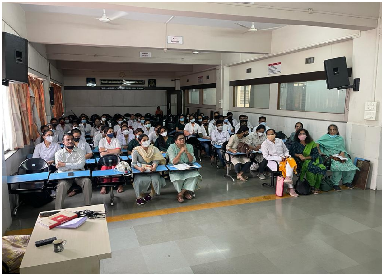
The Interns with the posting Incharges during the program