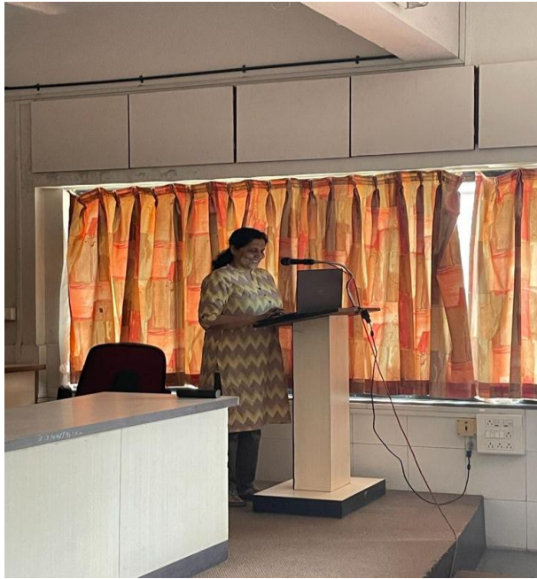
The ICTP Incharge addressing Interns