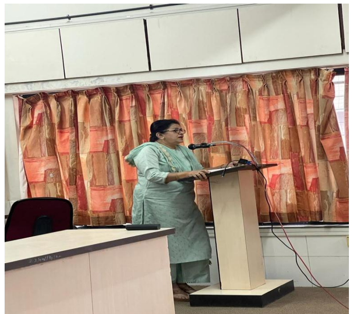
The Principal addressing the Interns